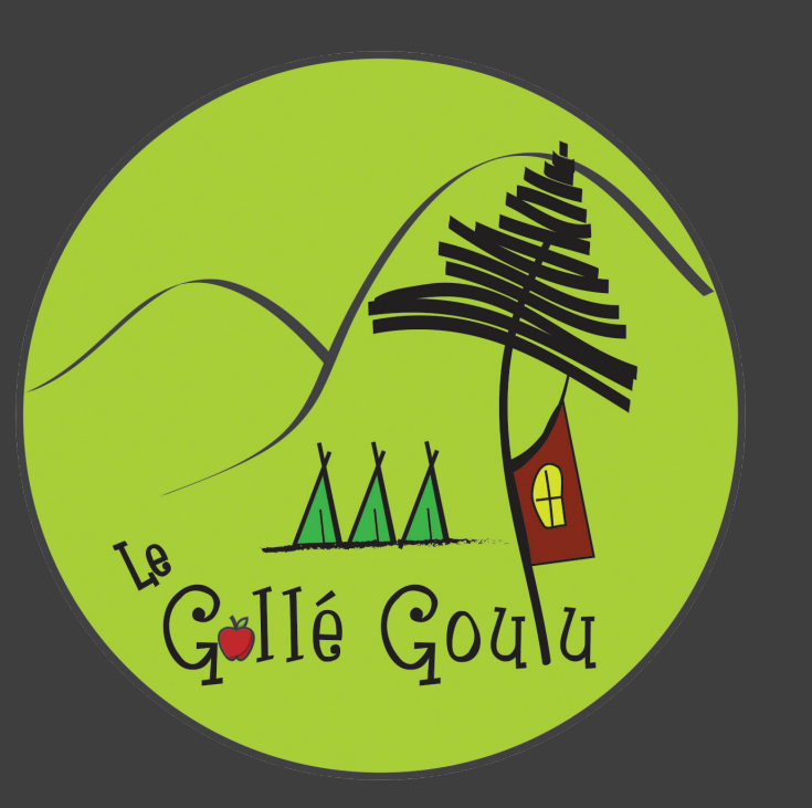
Illustration and layout: Chantal Locat